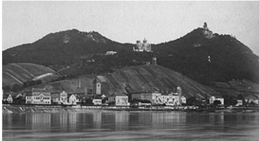
Drachenfels, with Castle Ruins on right mountain top. Photo: late 1800s.

this tree-trunk, Years of exposure to rain and storm had slightly deepened the channels we had cut, and the figure seemed a welcome target for our pistol-practice. It was already late in the afternoon when we reached our improvised range, and our oak-stump cast a long and attenuated shadow across the barren heath. All was still: Thanks to the lofty trees at our feet, we were unable to catch a glimpse of the valley of the Rhine below. The peacefulness of the spot seemed only to intensify the loudness of our pistol-shots -- and I had scarcely fired my second barrel at the pentagram when I felt someone lay hold of my arm and noticed that my friend had also someone beside him who had interrupted his loading.